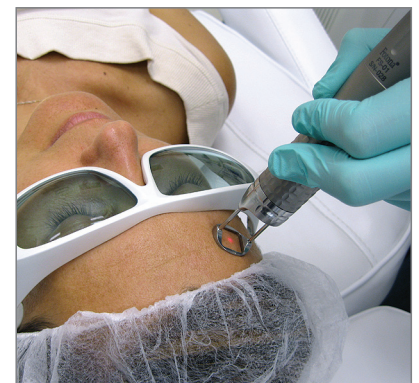
Fig.3: Fotona's FS01 handpiece - the latest breakthrough in fractional laser technology.

The new FS-01 handpiece is compatible with all Fotona aesthetic Er:YAG laser systems. No additional investment in adapters or cables is necessary.